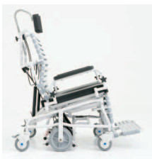
14° Posterior tilt