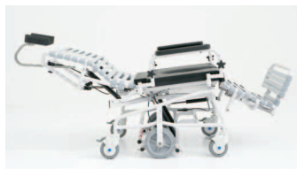
65° Back recline

Width adjustable armrests accommodate widths up to 33"