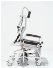
8° Anterior tilt