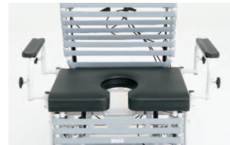
Open front commode seat facilitates peri cleaning

Width adjustable armrests accommodate widths up to 33"