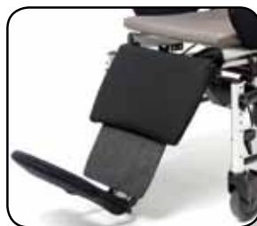
Length adjustable legrest