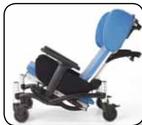
Up to 32° of seat tilt in all seat heights Front pivot seat tilt encourages proper foot on floor position while tilted