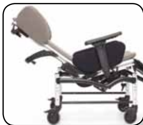
Up to 45° back recline